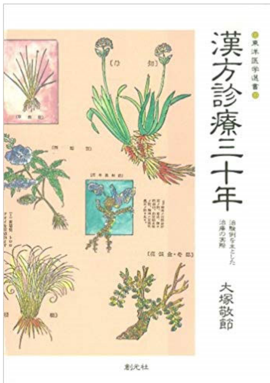
“30 Years of Kampo” Japanes original